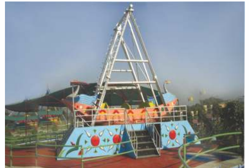
SWING SHIP 24 SEATER