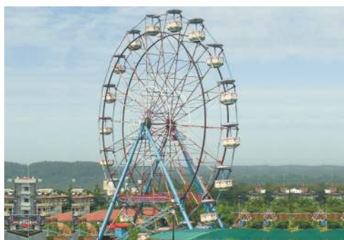
FERRIS WHEEL 90 FT