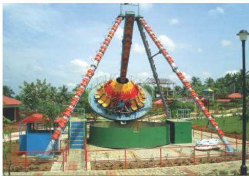
FRISBEE 20 SEATER