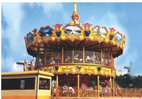
CAROUSEL DOUBLE DECKER DW-88A