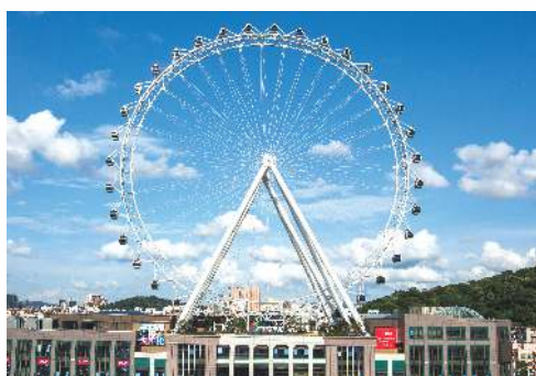
GIANT WHEEL GLC-83A