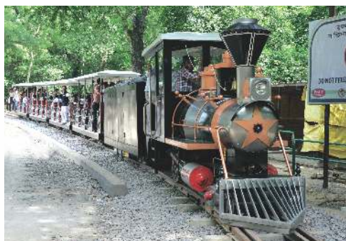
TOY TRAIN (BATTERY OPERATED)