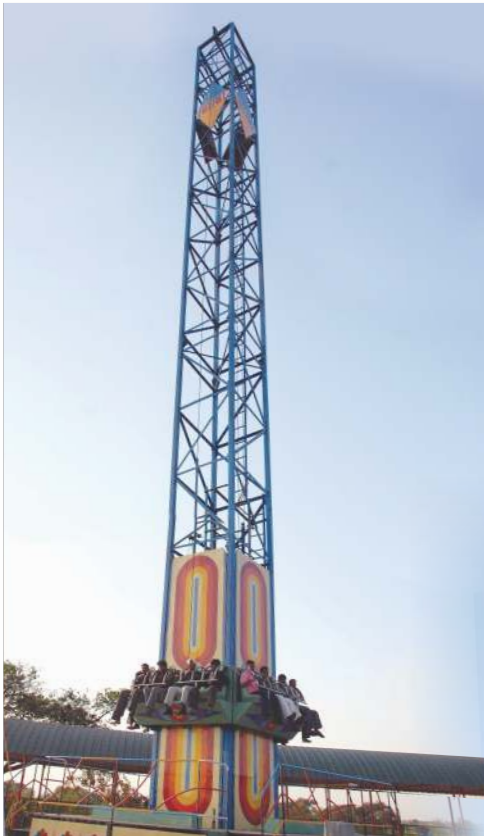
FREE FALL 120 FT