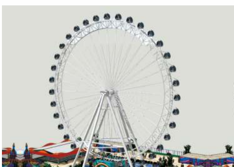
GIANT WHEEL GLC-62A