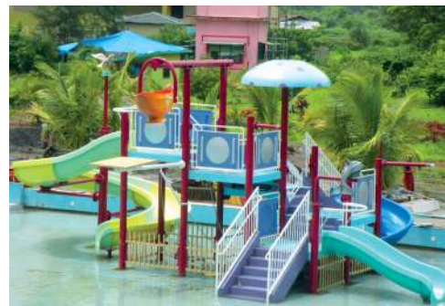
MULTIPLAYPEN 5 PLATFORM