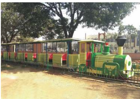
FAMILY TRAIN (ELECTRIC OPERATED)