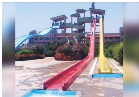
FREE FALL SLIDE