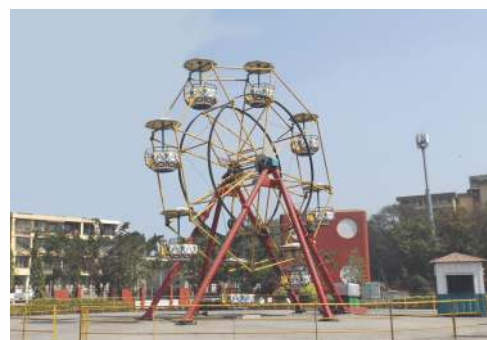
FERRIS WHEEL 40 FT