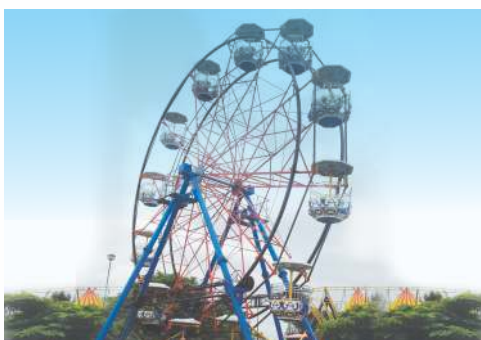
FERRIS WHEEL 60 FT