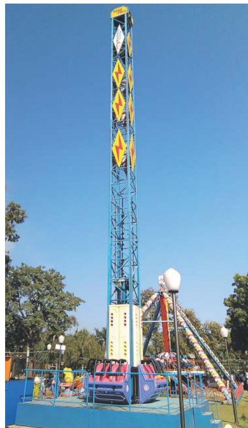
FREE FALL 70 FT