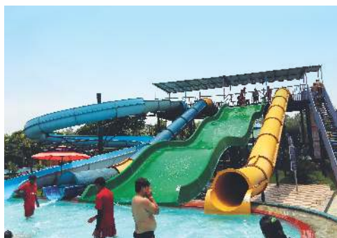
FAMILY LANE SLIDE