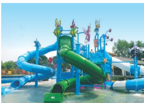
MULTIPLAYPEN AQUA THEME