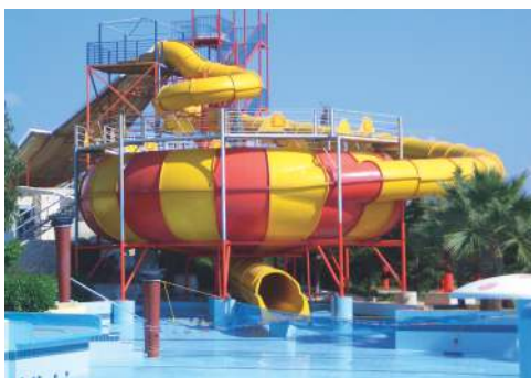
TURBO WATER CYCLONE