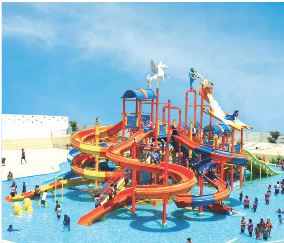
MULTIPLAYPEN 14 PLATFORM