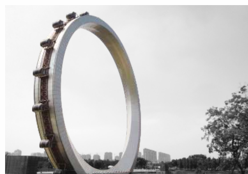
SPOKELESS WHEEL GLC-98A