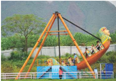
SWING SHIP 40 SEATER