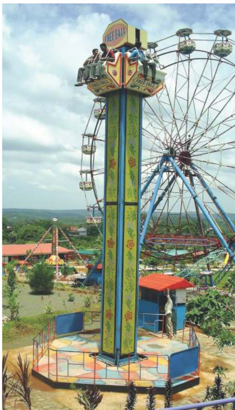
FREE FALL 40 FT