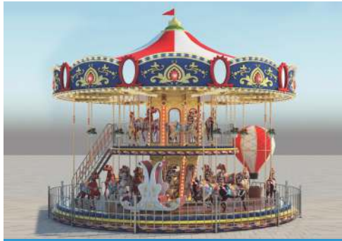
CAROUSEL DOUBLE DECKER