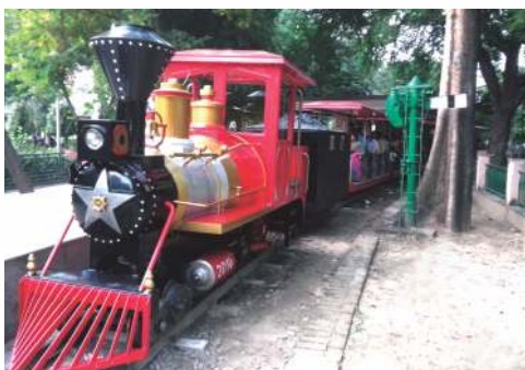
TOY TRAIN (DIESEL OPERATED)