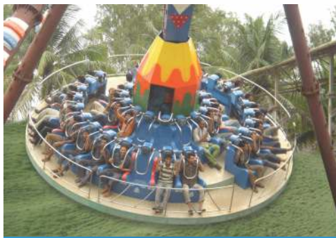
FRISBEE 40 SEATER