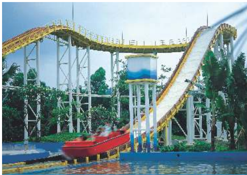
WATER CHUTE JL-30