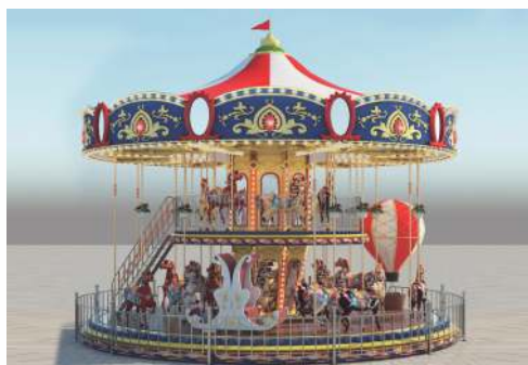
CAROUSEL DOUBLE DECKER