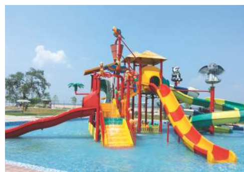
MULTIPLAYPEN 5 PLATFORM