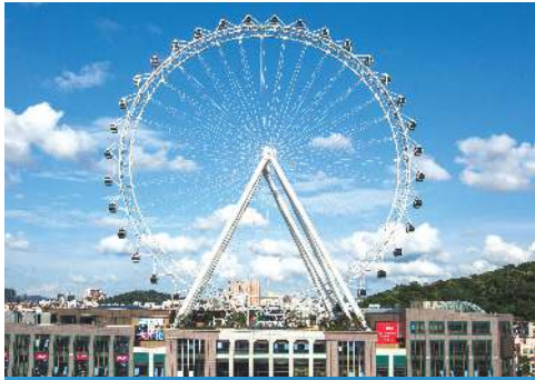
GIANT WHEEL GLC-83A