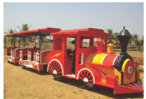
TRAIN (TRACK LESS)