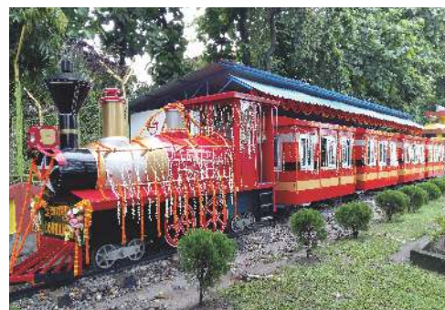
JOY TRAIN (DIESEL) CLOSED BOGIE