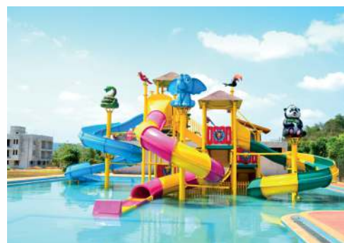
MULTIPLAYPEN 6 PLATFORM