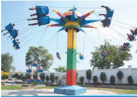
REVLOING SWING CHAIR