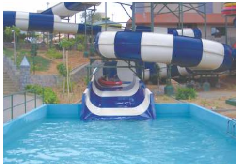
FLUME RAFT SLIDE